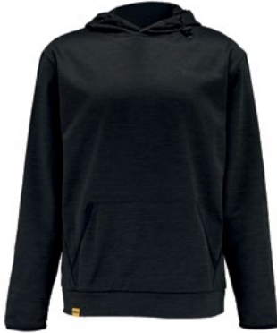
FALMOUTH Black Performance Hoody Available sizes: M-XXL

Black marl performance hooded sweatshirt with front pocket and 3 panel fitted hood. Lightweight 100% polyester fabric. Chest and sleeve print with a bound cuff. Twin needle hem & cuff.