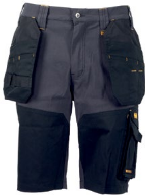
HAMDEN Grey/Black Short Available sizes: Waist: 30"- 42"