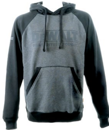
STRATFORD Available sizes: M-XXL

Black marl performance hooded sweatshirt with front pocket and 3 panel fitted hood. Lightweight 100% polyester fabric. Chest and sleeve print with a bound cuff. Twin needle hem & cuff.