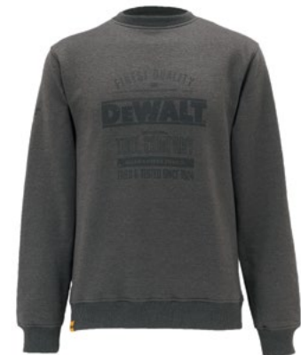
DELAWARE Available sizes: M-XXL

4 way Pro-Stretch, lightweight, work jacket. The fabric make up, 73% Rayon, 22% Nylon and 5% Spandex, is the same material as the DeWalt Memphis Trousers. Shower-proof fabric stretches and works as hard as you do, delivering all day comfort. Full length zip to center, and two zipped front pockets. Velcro adjustable cuffs, and a adjustable hem to secure the fit.