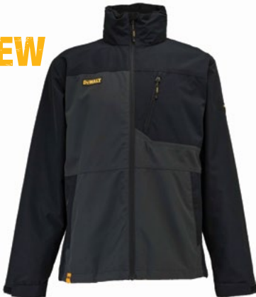
SOUTHAMPTON Available sizes: M-XXL

Waterproof work jacket with rip-stop coated outer shell. Back vent and membrane lining for airflow. Foldaway hood. Adjustable cuffs and hem.