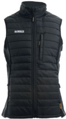
FORCE Gilet Available sizes: S-XXXL

A comfortable lightweight 100% polyester T-shirt with fast drying moisture wicking properties. Vented sides. Reflective Dewalt detail to chest. A garment to wear during those warm working hours or as an under garment during the winter.