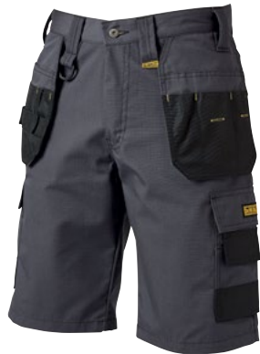
CHEVERLEY Grey Short Available sizes: Waist: 30"- 42"