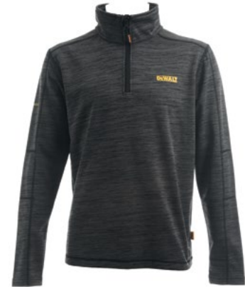
JONESBOROUGH 1/4 Zip Sweat Available sizes: S-XXL

Grey marl hooded sweatshirt. Three piece hood construction with flat draw-cord. 320gsm polycotton. Front Kangaroo pocket*. Self fabric side panels with eyelet holes for ventilation. Large DeWalt logo to front. Guaranteed tough logo to right arm. A warm garment for those colder days at work.