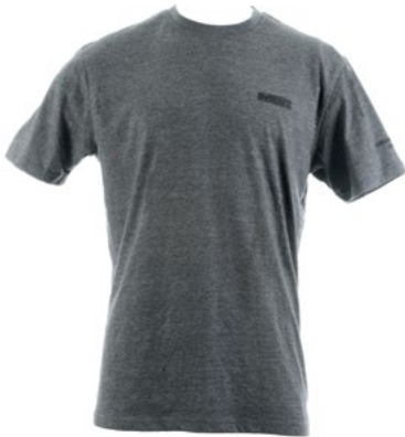
TYPHOON Charcoal Grey T-shirt Available sizes: M-XXL

Charcoal grey polycotton T-shirt with a ribbed crew neck for added comfort. Dewalt branding to chest & Guaranteed Tough logo to sleeve. Twin needle hem & cuff stitch.