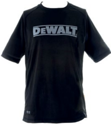
EASTON Black T-shirt Available sizes: M-XXL

A comfortable lightweight 100% polyester T-shirt with fast drying moisture wicking properties. Vented sides. Reflective Dewalt detail to chest. A garment to wear during those warm working hours or as an under garment during the winter.