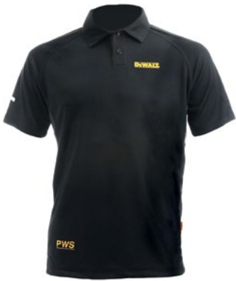
RUTLAND Grey/Black Polo Available sizes: M-XXL

Charcoal grey polycotton T-shirt with a ribbed crew neck for added comfort. Dewalt branding to chest & Guaranteed Tough logo to sleeve. Twin needle hem & cuff stitch.