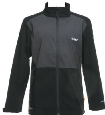
SYDNEY WHILE STOCKS LAST Available sizes: M-XXL

Waterproof work jacket with rip-stop coated outer shell. Back vent and membrane lining for airflow. Foldaway hood. Adjustable cuffs and hem.